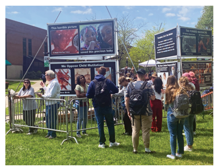
High winds can be dangerous during GAP, so our staff decided to reconfigure the display into three pods during one day of GAP at Marshall University.