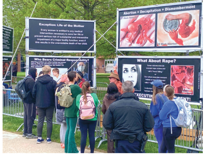
Students at Marshall University in West Virginia gathered around the GAP display to ask questions. Our team is trained and ready to answer.

A good number of our donors send gifts on a regular basis, and this is a tremendous help to us in planning projects and budgeting. We invite you to become a monthly, quarterly or annual donor.