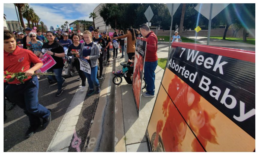
Many participants at the Arizona for Life March had not seen vivid photos of aborted children before they walked by our signs. We pray that the photos motivate people to be more energized in the fight to protect human lives.

Several kids intently looked at the signs. We overheard one child ask his parents, "They kill babies?" This demonstrates how important it is that we educate our children to protect them from future abortion decisions. Our signs prompt conversations that need to take place.