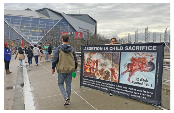
A majority of the 55,000 attendees of the Passion Conference were educated by CBR signs as they entered the venue in Atlanta.