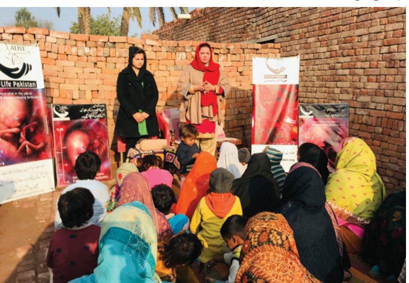
This was the first campaign of 2022 for CBR-Pakistan. Our affiliate has ambitious plans to conduct 48 campaigns this year – four each month.