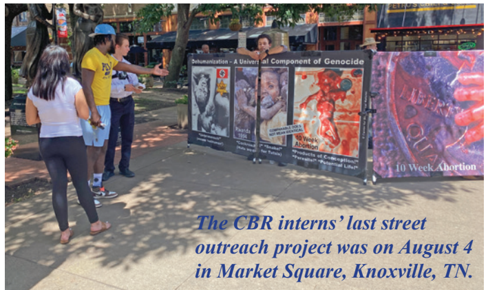
The CBR interns’ last street outreach project was on August 4 in Market Square, Knoxville, TN.