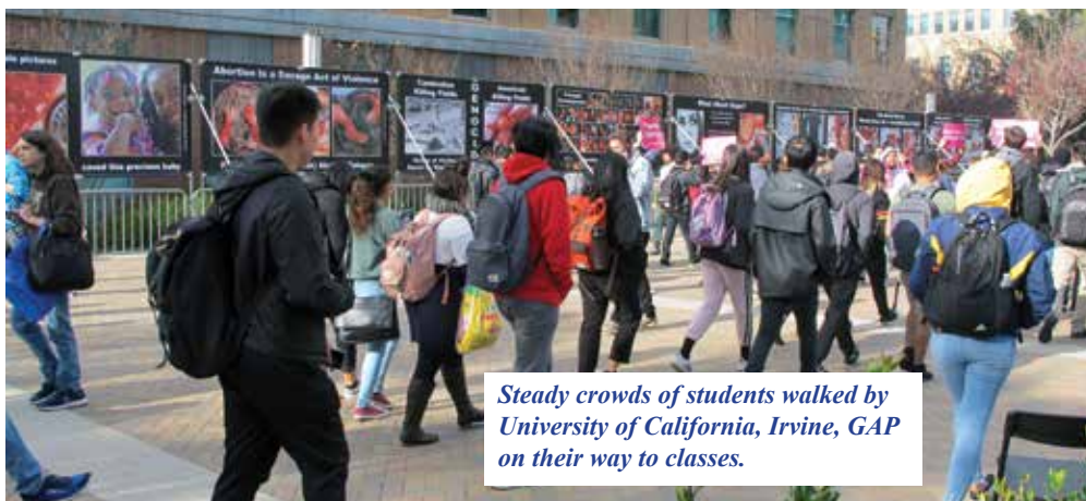
Steady crowds of students walked by University of California, Irvine, GAP on their way to classes.

An arrogant student planted herself directly in front of our display, announced that she was a Christian (Continued on page 2)