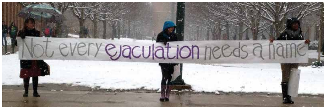
GAP returned to George Mason University on March 24-26, 2014. Pro-abortion students made this dehumanizing statement against preborn children on a sign.

A member of the VT housekeeping staff cried as she stared at the 22-week abortion victim photo. When asked if she was OK, she replied, "I almost did that to my now 27-year-old son. Thank you for being here. I will take a brochure back to women I work with."