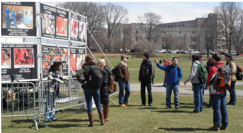
Students debate abortion at the Virginia Tech GAP display on March 27-28.

Even after seeing how effective GAP is at preventing people from ignoring or trivializing abortion, some pro-lifers still resist showing the truth. One of the SFL club members was quoted as saying, "I just don't want to dehumanize and objectify these children. They all have a story. They should all have a name." She was nearly mimicking the AFL president, and both of them