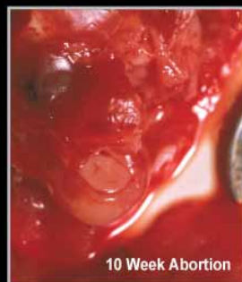
10 Week Abortion

American Roentgen Ray Society, ARJ, July 2004, Vol. 183 No. 1 229-235