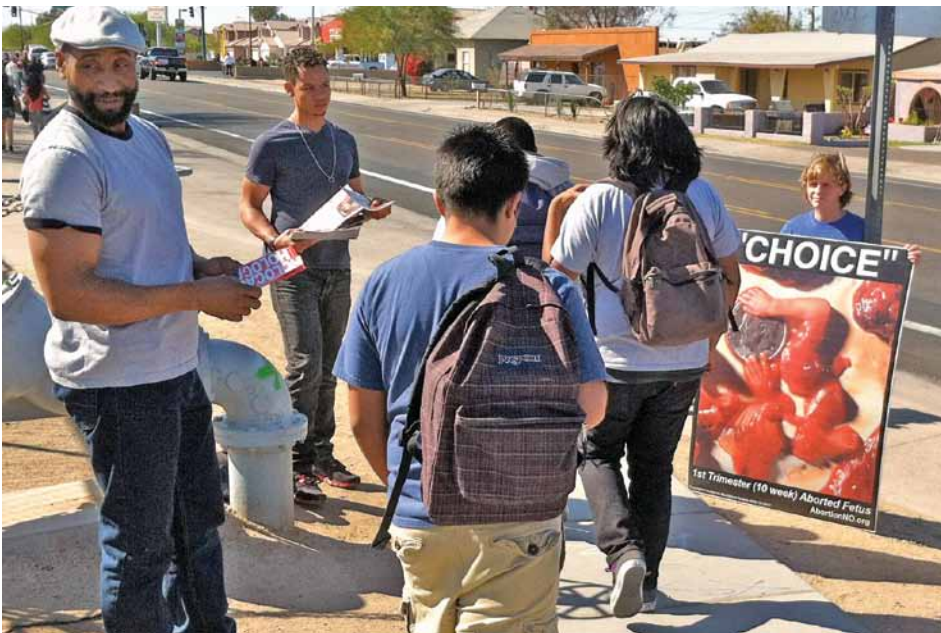
CBR-Arizona held a School “Choice” Project at South Mountain High School in Phoenix on March 2nd. It’s a predominately African-American school, so we were blessed to have three African-American volunteers help interact with students.