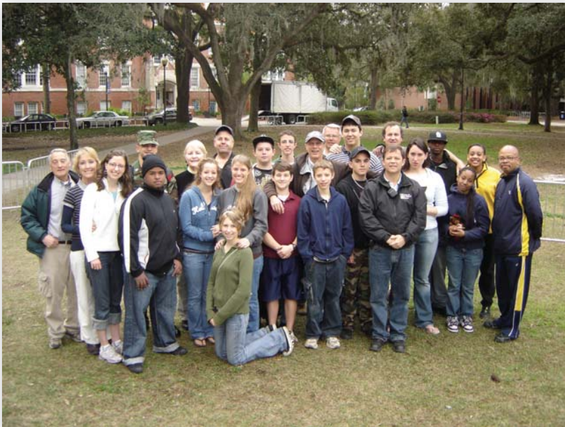
The UF GAP team included not only the sponsoring students, but also staff and volunteers from FL, OH, NJ, TN and Canada.

We are forcing students to think hard about abortion and their own world views. Your support of our work will save babies' lives far into the future. These students will have the visual evidence of the hideousness of abortion in their minds every time they hear the word "abortion" and when they eventually face pregnancy and abortion decisions.